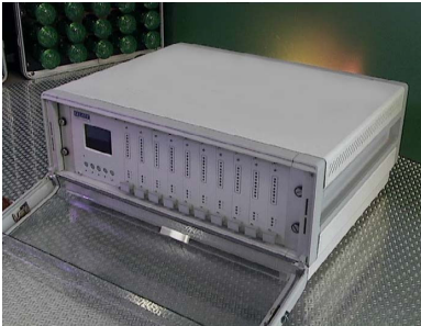
LM8000D Neon 80 Channel Dimming programmable controller.