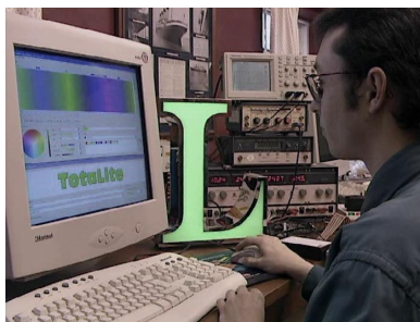
Colour sequences (above) with 'ColourMaster' Configuration Tools. Configuring LM8000D (below) with LightMaster Configuration Tools.